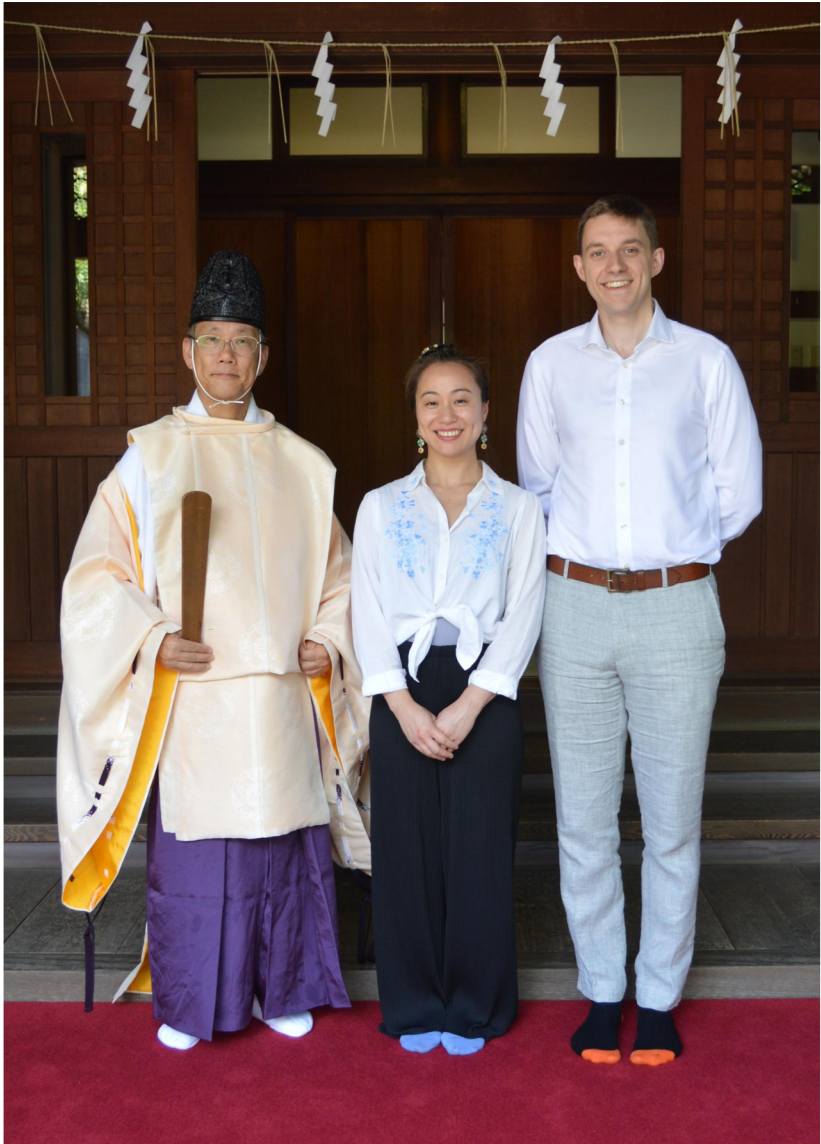
2023 - A blessing in Tokyo, Japan.