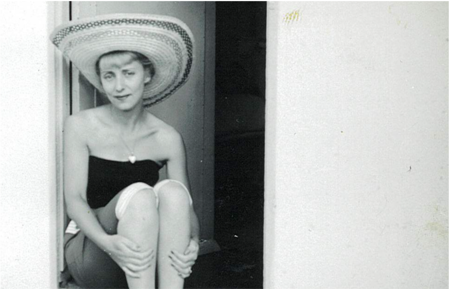
"I'll Be Seeing You" By Peggy Lee