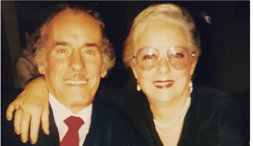
"Smile" by Nat King Cole