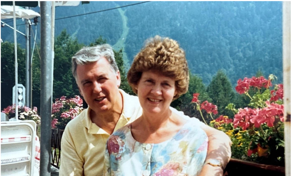
Holidaying in 1989