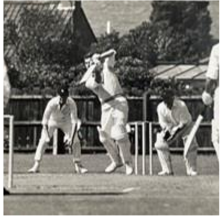
Four at Felixstowe