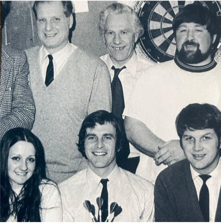
Flights of fancy