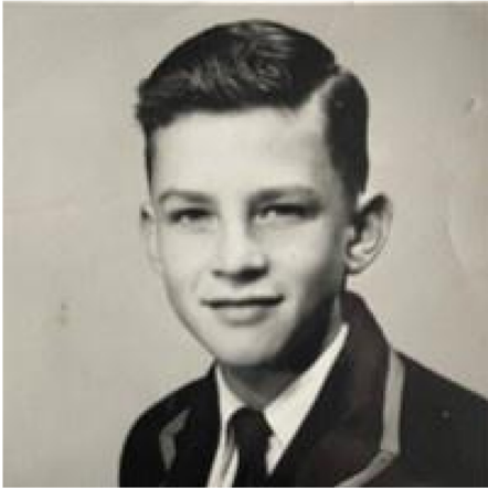
Grammar school garb