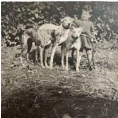
Curbing the curs