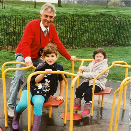
Our crown jewels