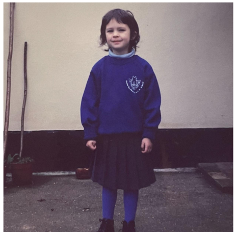
Dear little thing