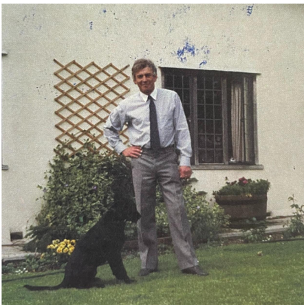
Friend at The Forge