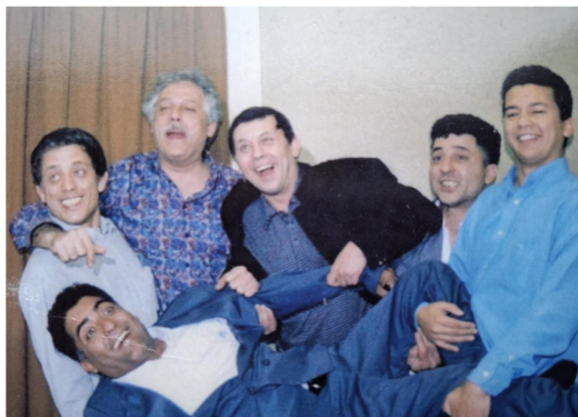
All the brothers together